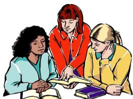
Women's Bible Study

We all know it's important to study God's Word. But sometimes it's hard to know where to start. What's more, a lack of time, emotionally driven approaches, and past frustrations can erode our resolve to keep growing in our knowledge of Scripture. How can we, as Christian women, keep our focus and sustain our passion when reading the Bible?