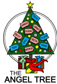
THE ANGEL TREE

Trinity will once again sponsor the Angel Tree Project. At this time we are asking the congregation for names of family, friends and neighbors who may be struggling this Christmas. If you know of someone, please pick up an "Angel Tree Request for Information" form, located on the Information Center in the narthex. Once you've completed this form place it in the decorated box on the Information Center. Please do so by Sunday, October 27. All information will be kept confidential. The Angel Tree will be decorated and in the narthex the weekend of November 7/8. At that time you will be able to choose an "Angel" to gift.