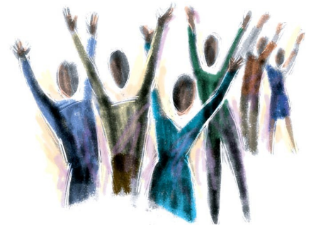
Serve the Lord with Gladness

If you have a topic for me to address or a comment, please email me.